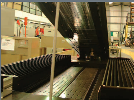
Compact 1 metre bridging module