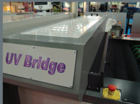
UV Bridge positioned on inlet