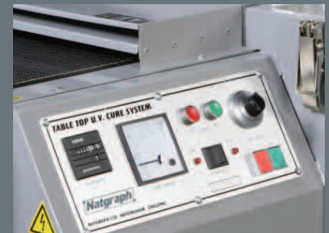
TTUV - ammeter / hour meter